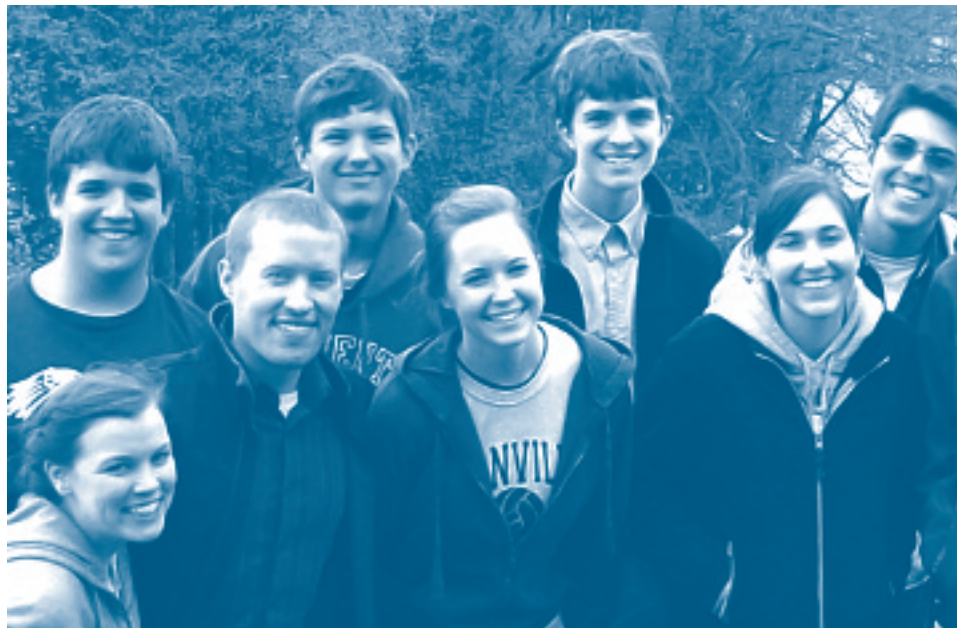
A group of students and leaders enjoying last year's Spring Retreat.

This rings true with my experience working alongside young people and seeing how